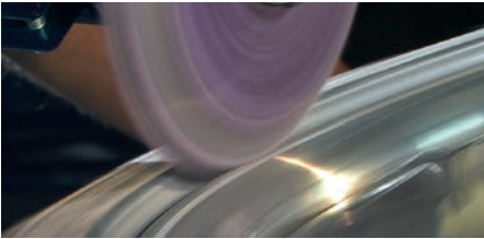
Rotary grinding procedure: The rotating wheel and the grinding wheel as well as the position and inclination of the wheel on the machine ensure that the work is as accurate as possible.