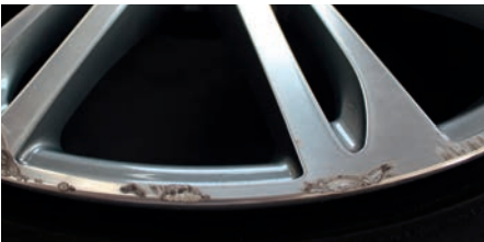
Whether kerb damage or corrosion damage ...