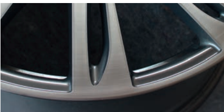
... after WheelDoctor processing, the (polished) alloy wheel looks like new.

Whether curb scratches or corrosion damage - there are about 31 million damaged alloy wheels in Germany. But this problem does not merely interfere with the visual appearance of affected cars. The vehicle inspection sticker is also at stake. Because superficial, harmless looking notches can cause cracks that have fatal consequences for driving safety. That is why almost 400 companies now rely on WheelDoctor – which has 2 TÜV approvals – thus benefitting from the potential to generate more sales revenues by eliminating this damage. With each revolution of the wheel.